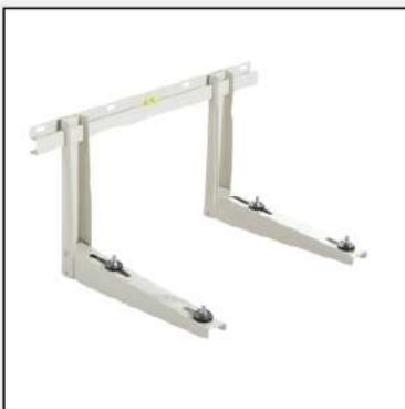
BRACKET - 36000 BTU