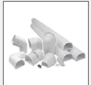
HVAC LINE COVER KIT - 3", 4"