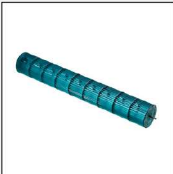
CROSS FLOW FAN BLADE