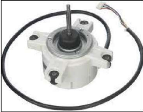
FAN MOTOR - 0.D