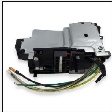
ELECTRONIC CONTROL BOX ASSEMBLY - INDOOR