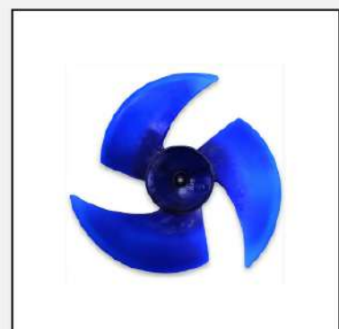
AXIAL FLOW FAN