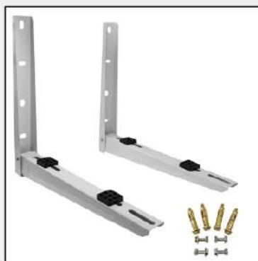
BRACKET - 12000 - 24000 BTU