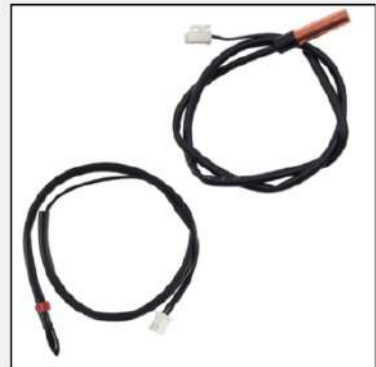
AMBIENT TEMPERATURE SENSOR ASSEMBLY