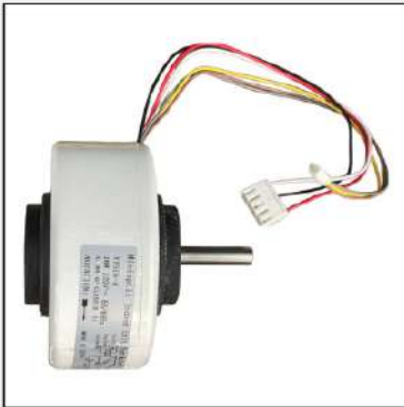
FAN MOTOR - I.D