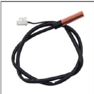
PIPE TEMPERATURE SENSOR