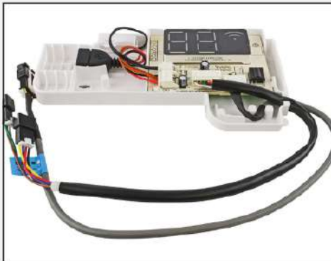
DISPLAY BOX ASSEMBLY